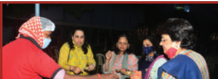
Phuchka - favourite then, favourite now