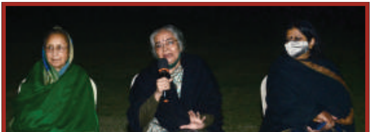
Thank You for your support