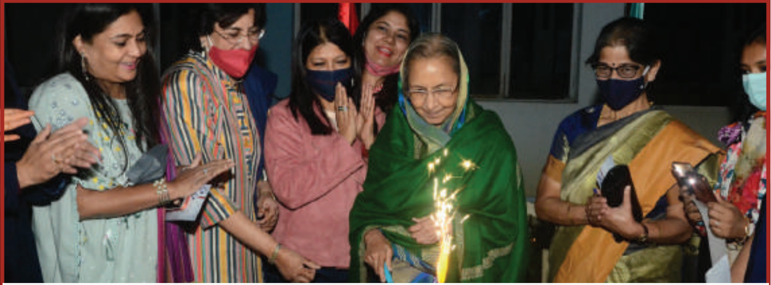
Keeping the Modern High flame aglow, even on a cake!