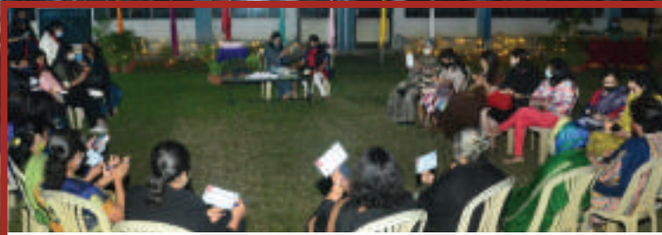
The MHS bingo