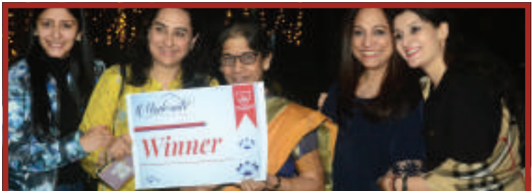
Hip hip hurrah!