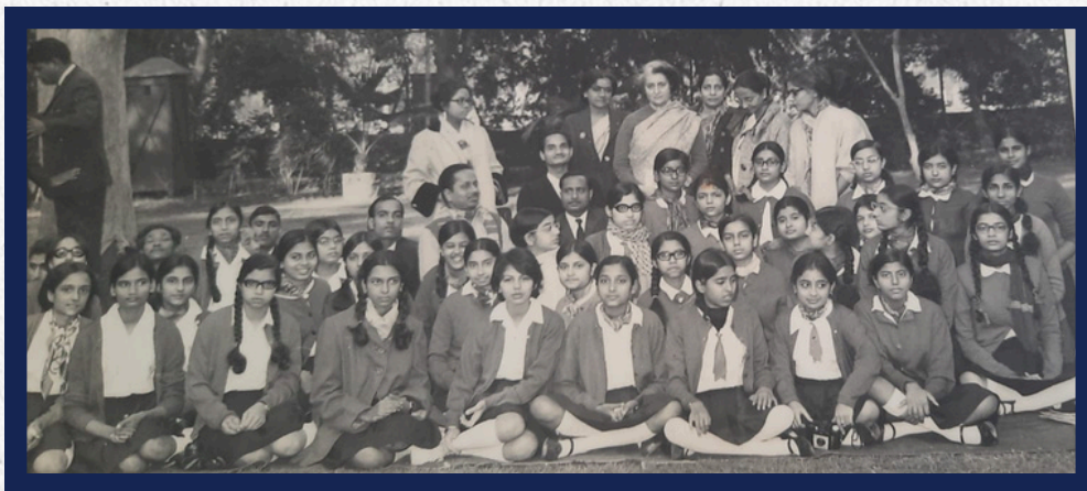
Class XI students of MHS with Mrs. Indira Gandhi at her residence. The author is seated in the 2nd row, 5th from the right.