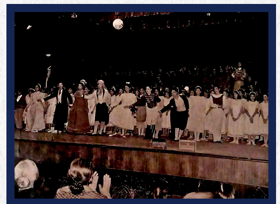
'The Nutcracker': curtain call