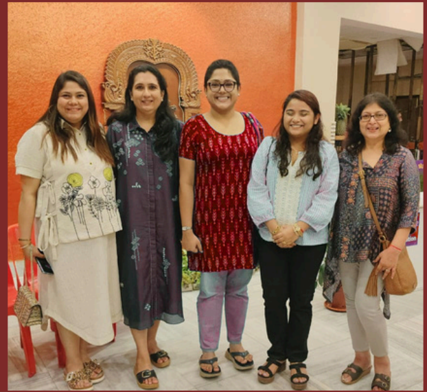
AMHS Team at Funtakshari