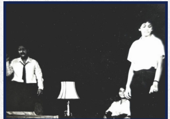
British Council play in 1987