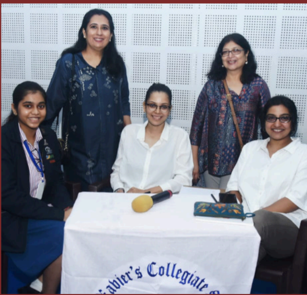
AMHS Team at ALSOC Quiz