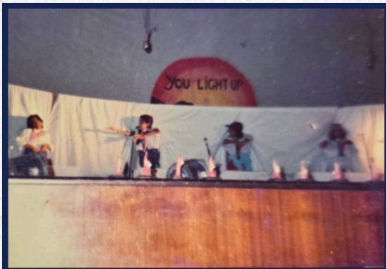
Midget show on Teachers' Day in 1983