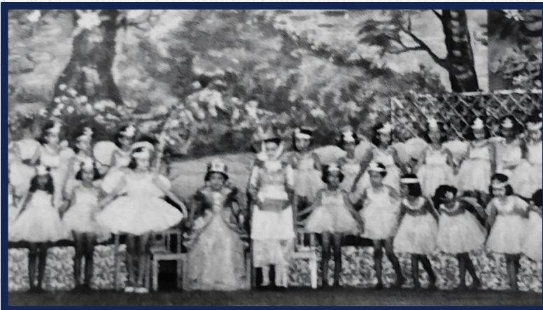
The author in the centre as “Princess Tiny Tot” in a school programme in the 1950s.