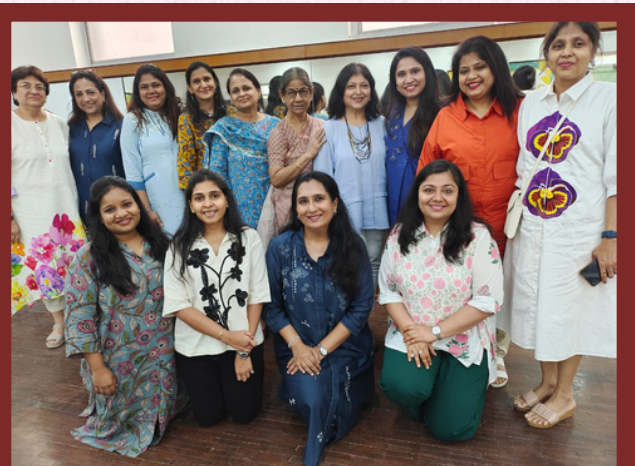
AMHS Annual General Meeting 2025