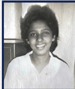
The author in the 1980s