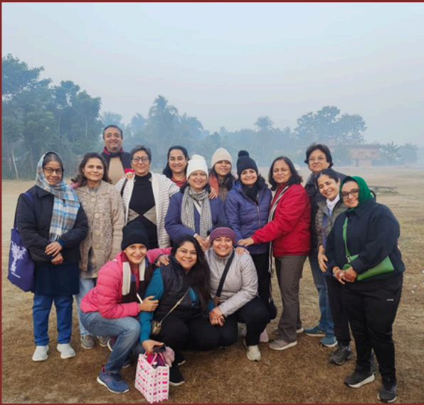
Nolen Gur Walk