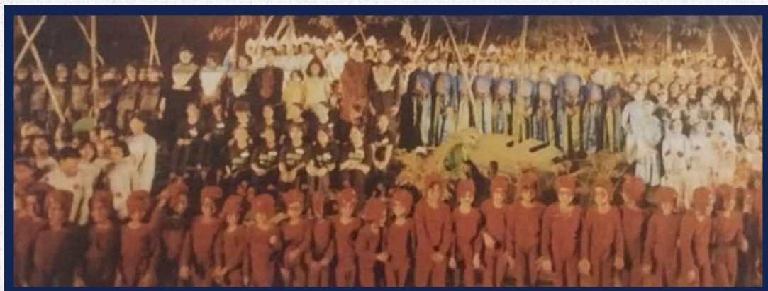
Jungle Story: curtain call